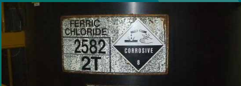
Image: Ferric Chloride