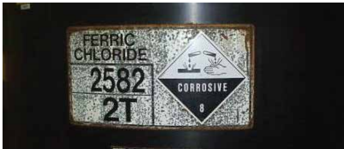
Image: Ferric Chloride